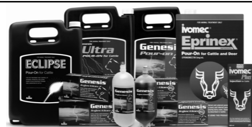
POWERBUILT TOOLS with Merial Ancare products See in-clinic display for details

If you would like to discuss your own situation in detail with one of our vets please call us.