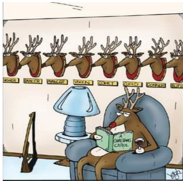
All of the other reindeer used to laugh and call him names.