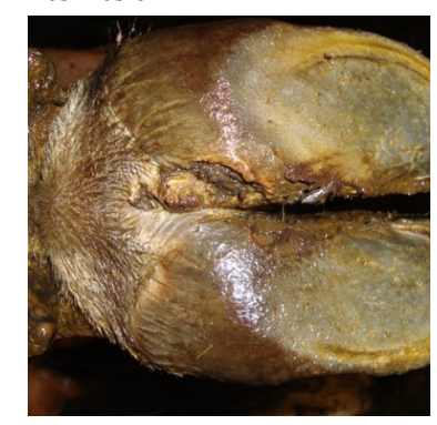
More chronic case