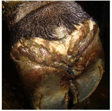
Chronic severe lesion