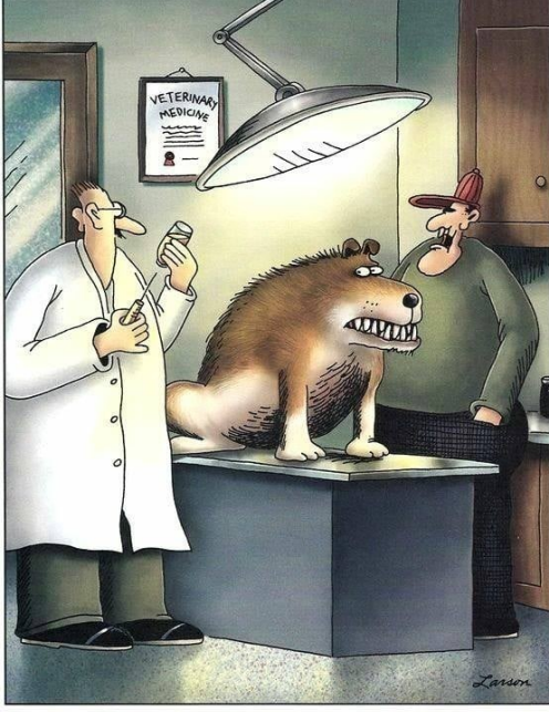
Whoa! Is that a needle, Doc? 'Cause Zack don't like needles.'