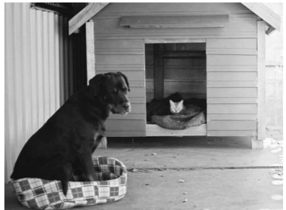
How to tell if you are a Loser