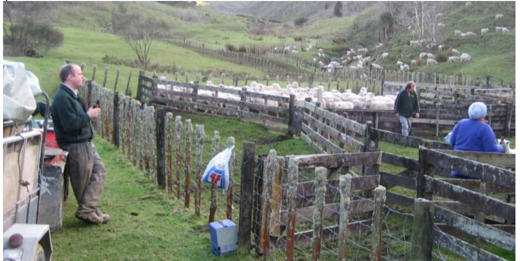
He looks busy - doesn't he!

Once again we are pleased to have David Lloyd scanning ewes, and after last year's drought-affected average of 126%, this year the going rate is above 150%, and many are above 180% - so the potential for bearings problems is back as well (very few last year). David is leaving most farms with a 'nice' problem; with lamb prices now expected to be a little down on this year's lolly scramble, the emphasis is now on maximising lamb survival rates. More on this will come with your individual scanning results letter.